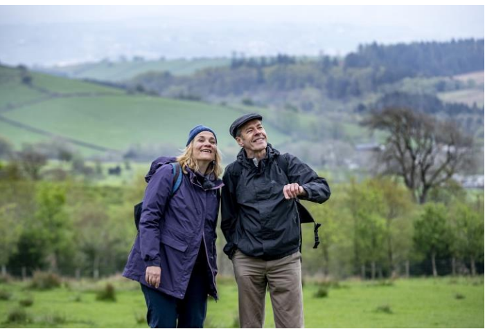
Two stills from the Tracy Chevalier visit, later featured in Lancashire Life and other local news