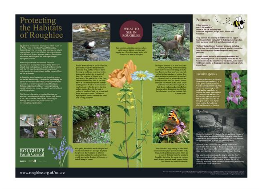
Roughlee Habitat project - new interpretation board