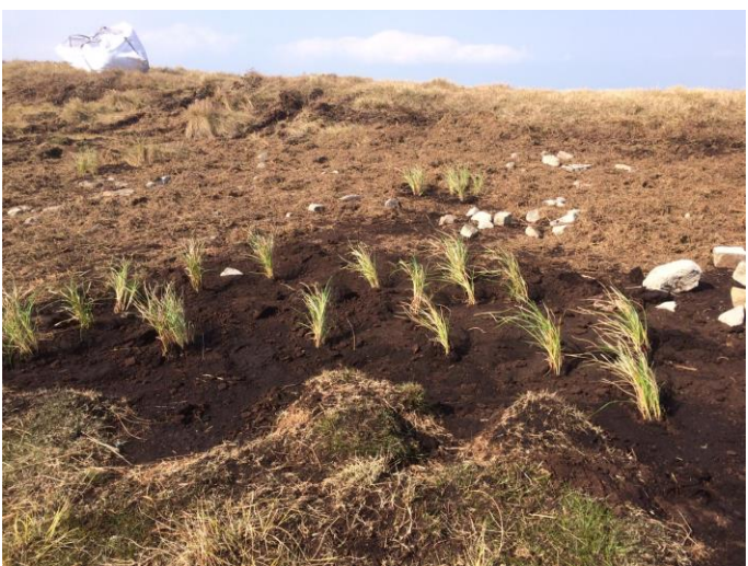
Staff and volunteers carry plants up the hill, ready for planting into the bare peat at the Engagement Day