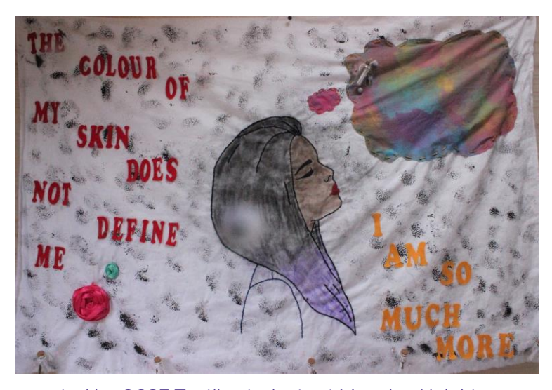
Work in progress, and a completed banner created by GCSE Textile students at Marsden Heights