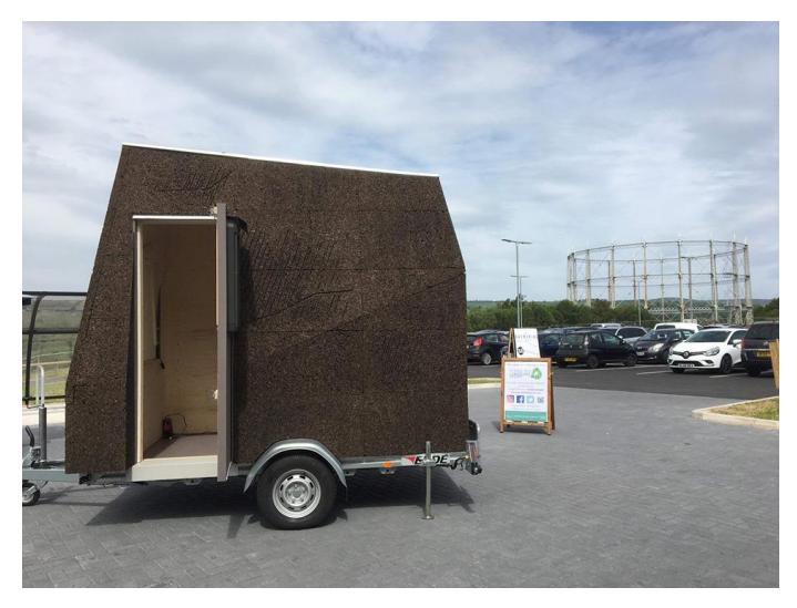
Talkaoke session at the Gathering Event, and the new Pendle Hill Mobile Hut

Attendees were also invited to contribute to the Pendle Hill Memory Map: What the Hill Heard by providing an anecdote, fact, memory or drawing that Pendle Hill has witnessed. There were also family friendly free activities throughout the day including talkaoke inspired by personal experiences of Pendle Hill, an introduction to dry stone walling and opportunities to learn more about the PHLP.