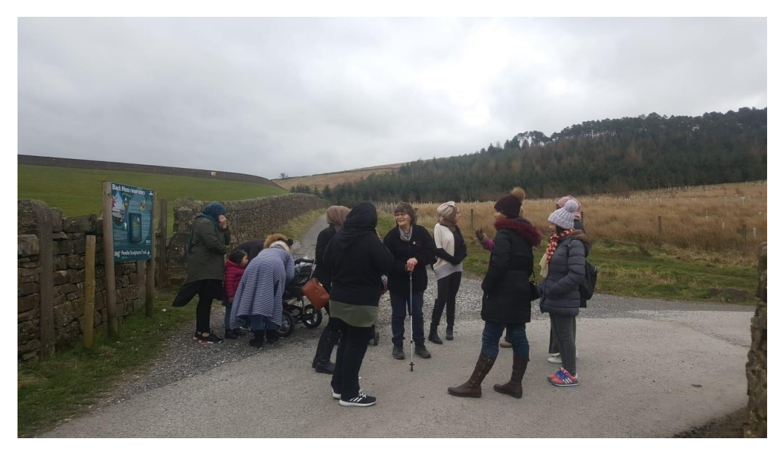
ZK Arts - Rise Up project visiting the Pendle hill area for artistic inspiration

We have started to think about plans for Year 2 and the Fund will re-open for applications on 18<sup>th</sup> August. Panel members were re-appointed at the end of June, with the addition of two new members.