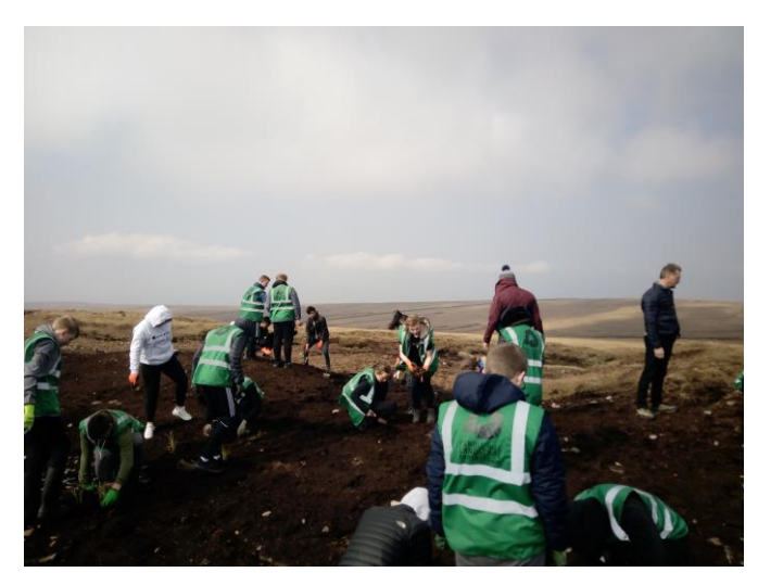
Lancashire Police Cadets getting into volunteering