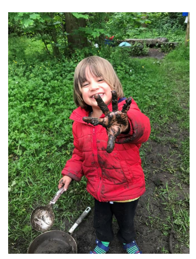
Little Saplings activities: Dad den building and mud kitchen