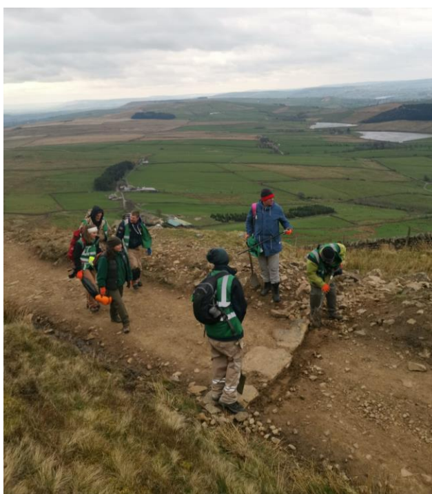
PEN activity sessions walking and working in the landscape