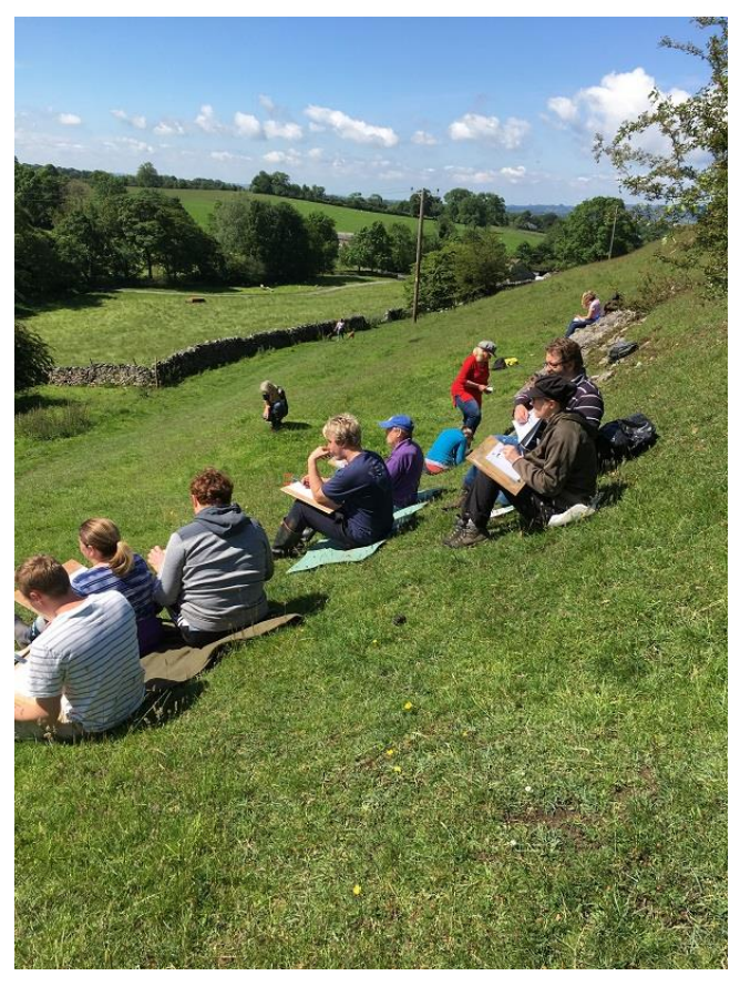
Artists and botanists at Worsaw Hill