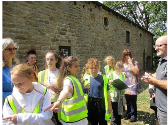
Pupils involved in developing a treasure trail for Barrowford village